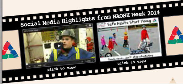
NAOSH Week Information package