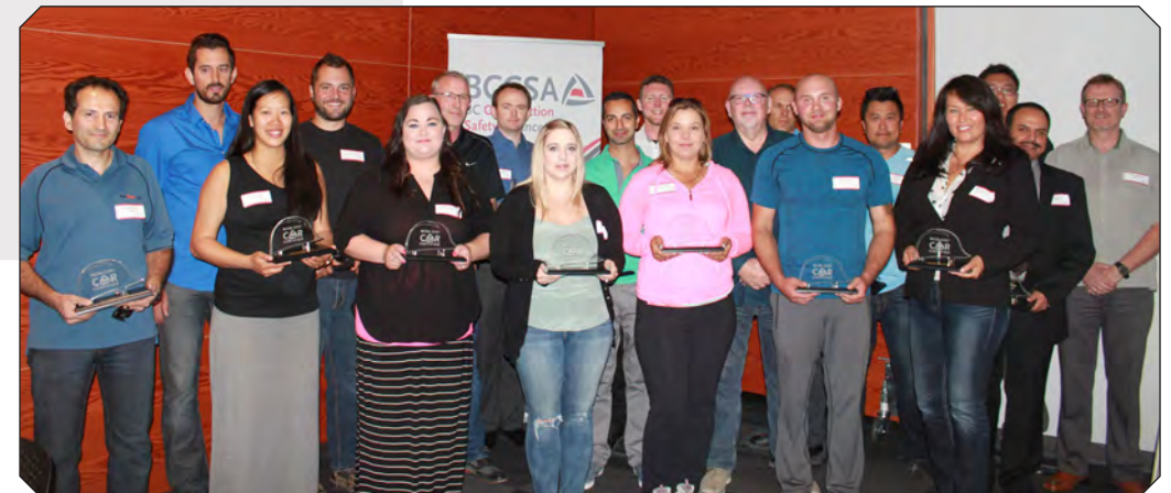
Newly certified Lower Mainland COR companies at Vancouver Regional Breakfast

Recognizing that the success of our renewal plan would depend on building positive connections