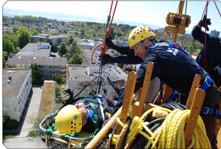
THARRP (Technical High Angle Rope Rescue Program) training session

THARRP (the funding for which is administered by BCCSA) is a five-course train-the-trainer program offered by select BC fire departments to prepare personnel in technical procedures for rescuing workers in distress while working at heights (e.g., tower crane operators). As of December 31, 2014 nine construction site/worker rescues were carried out, 147 instructors at 34 fire departments received a total of 31,180 training hours, and 94 crane site surveys were conducted.