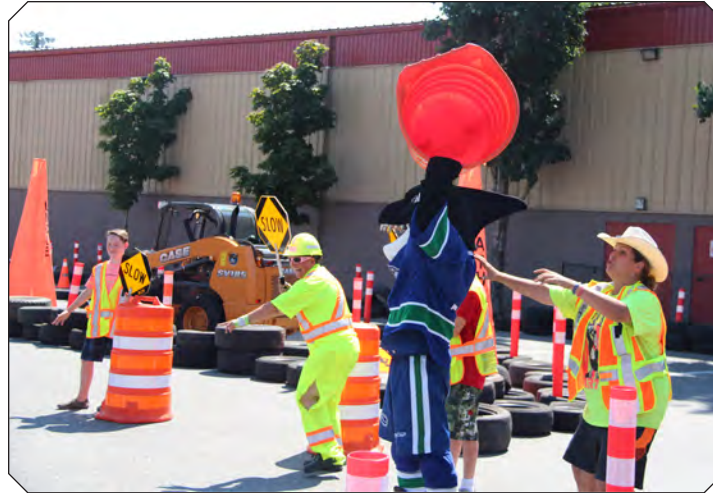
The Cone Zone Event at the Cloverdale Rodeo