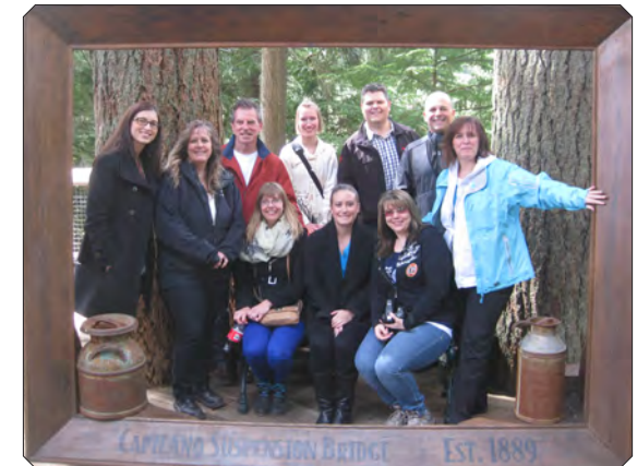
2014 NAOSH Committee