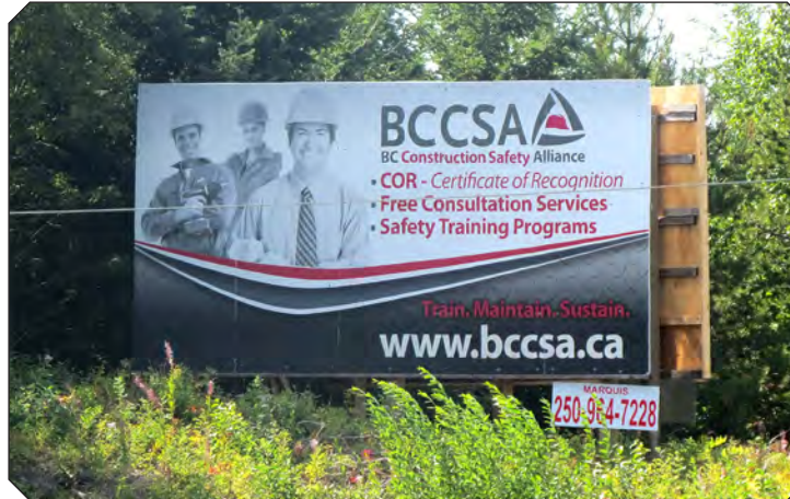
BCCSA billboard on display in Prince George BC

We also raised our profile via a year-long radio campaign that resulted in significant boosts to web traffic and program and service enquiries, and sparked increased enrolment in both our on-line and classroom-based safety courses.