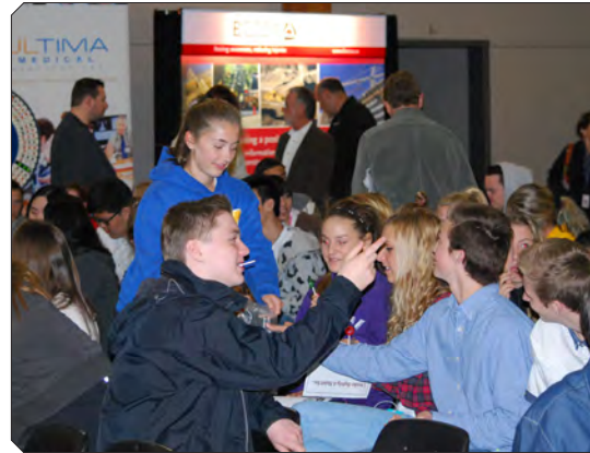
NAOSH BC Launch Event May 2014