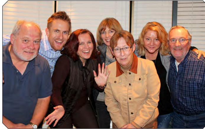
BCCSA Instructor Workshop

The TCP training program is the only standardized program of its kind acceptable to WorkSafeBC under Section 18.6 of the Occupational Health and Safety Regulation for high-risk traffic control. Since 2009, BCCSA has prepared TCPs for the high-risk conditions under which they work. During 2014, a total of 5825 TCPs were trained, and another 1067 were recertified, bringing the total to 6892.