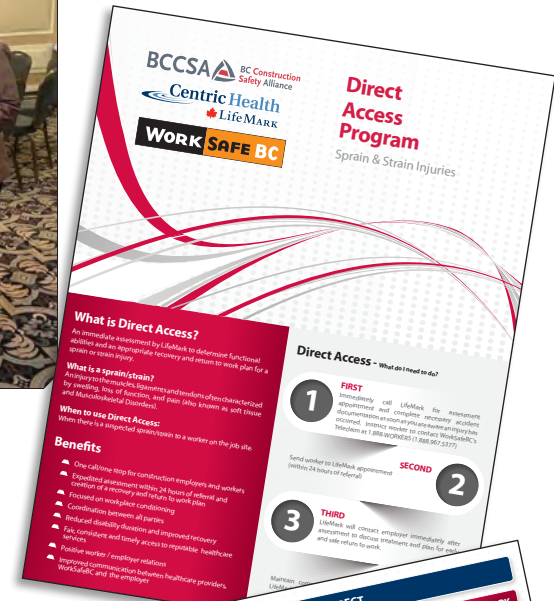
Collateral material for the Direct Access Program

Although soft tissue injuries account for roughly 45% of all construction injuries and have been shown to respond well to early intervention, it can sometimes be weeks before treatment begins. The goal of the Direct Access Program, a collaboration with WorkSafeBC and Centric Health – is to provide treatment and an acceptable return-to-work plan on the same day or within 24 hours after an injury occurs. The benefits of early and safe return to work are well known. This project represents BCCSA's continuing emphasis on